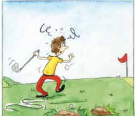
Answer: If you just control capital turnover (body rotation) without having a good margin (impact control), you're not effi-