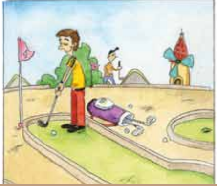
Answer: If you only manage based on the margin (control of impact), without controlling capital turnover (body rotation), you can't