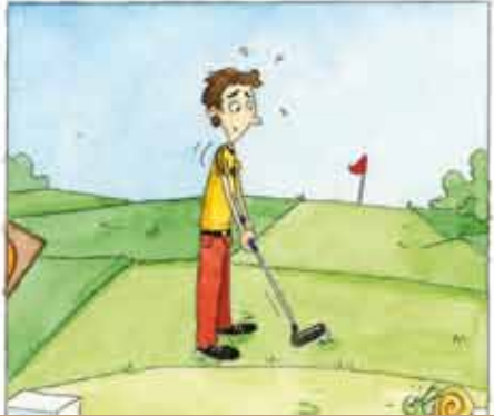
make the business profitable (you don't hit very far) and you can't stay in the competition (might as well take up miniature golf).