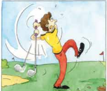
client (you get dizzy and lose sight of the target).