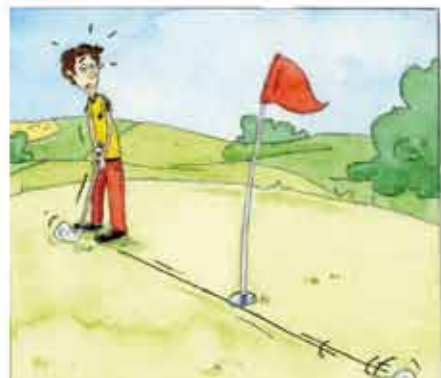
Answer: If you don't take external factors into account (if you don't change clubs according to the course), you can't win in the