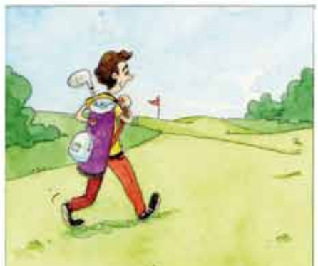
medium term (you miss the target).